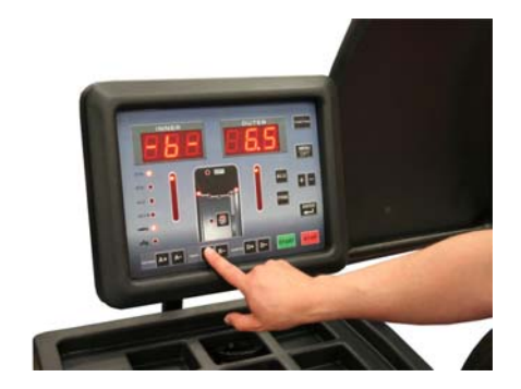
"D" (diameter of the wheel in inches; Use caliper, or refer to marking on tire)