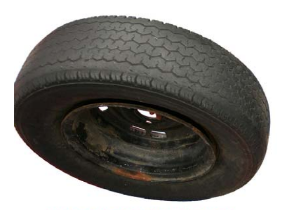
Unacceptable Tire And Rim For Calibration

STEP 1: Use a 15 inch diameter, 6 inch wide (P205/70 R15 or P215/70 R15), slightly used or new steel wheel and tire on the balancer. Only a hub-centric wheel may be used. Wheels that are lug-centric (center on the studs, not the center hole) cannot be used for calibration. Trailer wheels cannot be used for calibration. Aluminum or alloy wheels cannot be used for calibration. The wheel used must not have any weights installed. The only weight you will use in the calibration procedure is the special (red) calibration weight provided with the balancer. Failure to follow these instructions will result in an incorrect calibration and poor balancing accuracy.