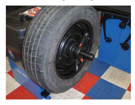
STEP 6: Verify that the balancer is in DYNAMIC mode, then manually enter the...

NOTE: Over tightening the Quick Nut will cause damage to the nut.