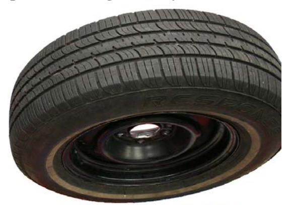
Acceptable Tire And Rim For Calibration