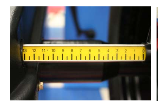
Example 1 (shown): 13.1cm X 10 = 131mm (Enter 131 as "A")