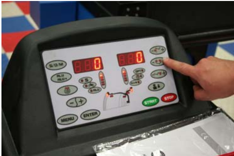
"D" (diameter of the wheel in inches; Use caliper, or refer to marking on tire)